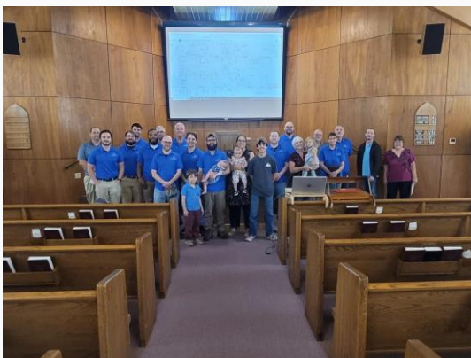
Benton Harbor - Campaign

We completed our Summer Quarter in early September. I was blessed to teach the book of Galatians , and all of the students did great, making high marks on their work and final. Then they had a week and a half off to serve the Lord in Michigan and relax a bit, visit family, and supporting congregations. Yesterday, the 17th of September, we began our Fall Quarter. I am blessed to teach Jeremiah and Lamentations this quarter. I teach the books chronologically, which helps with the historical flow, and I have always enjoyed this class. The students will also take courses like Job, Ezekiel and Daniel, Greek IV, Bible Archeology, Godhead, Romans, and The Christian Home . Please pray for these future preachers as they embark on this new quarter.